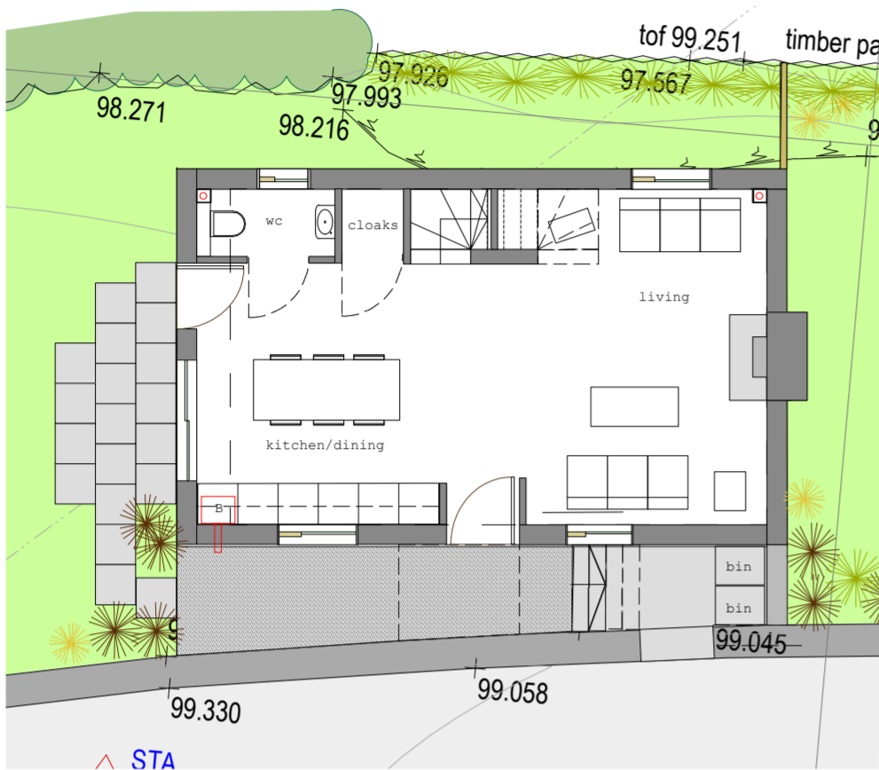
House 1 Ground Floor Plan 1.100