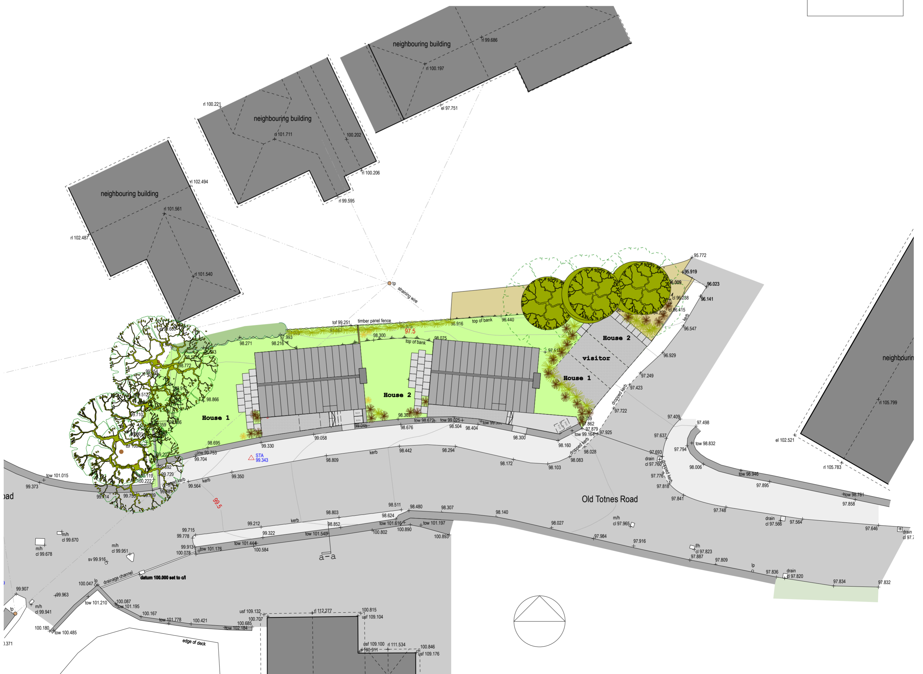
Site Plan 1.200