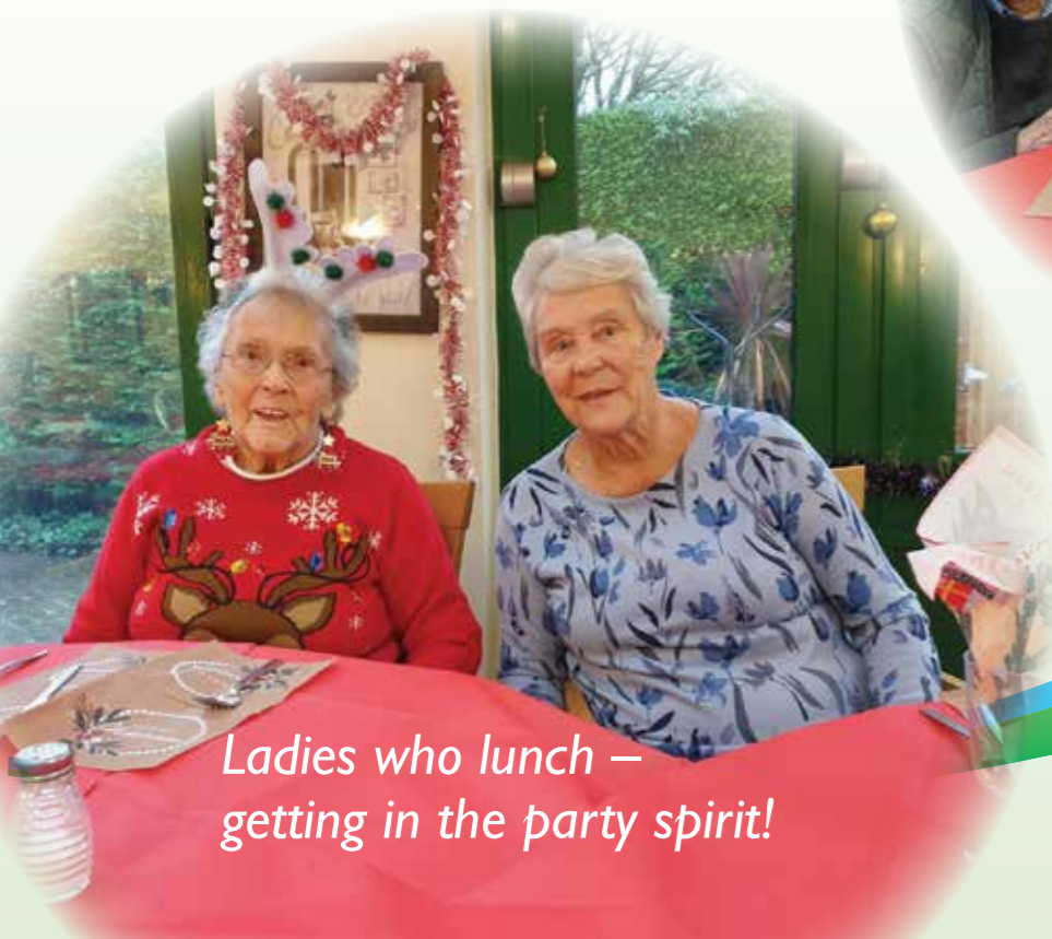
Ladies who lunch – getting in the party spirit!