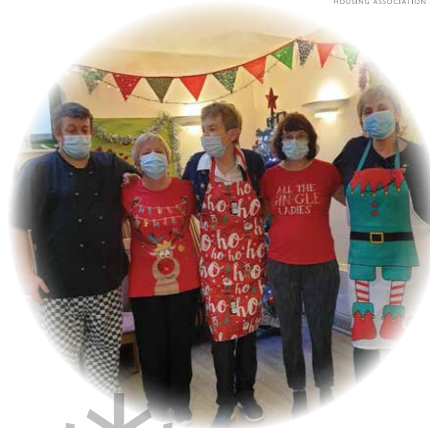
'Merry Xmask' as care home staff put safety first